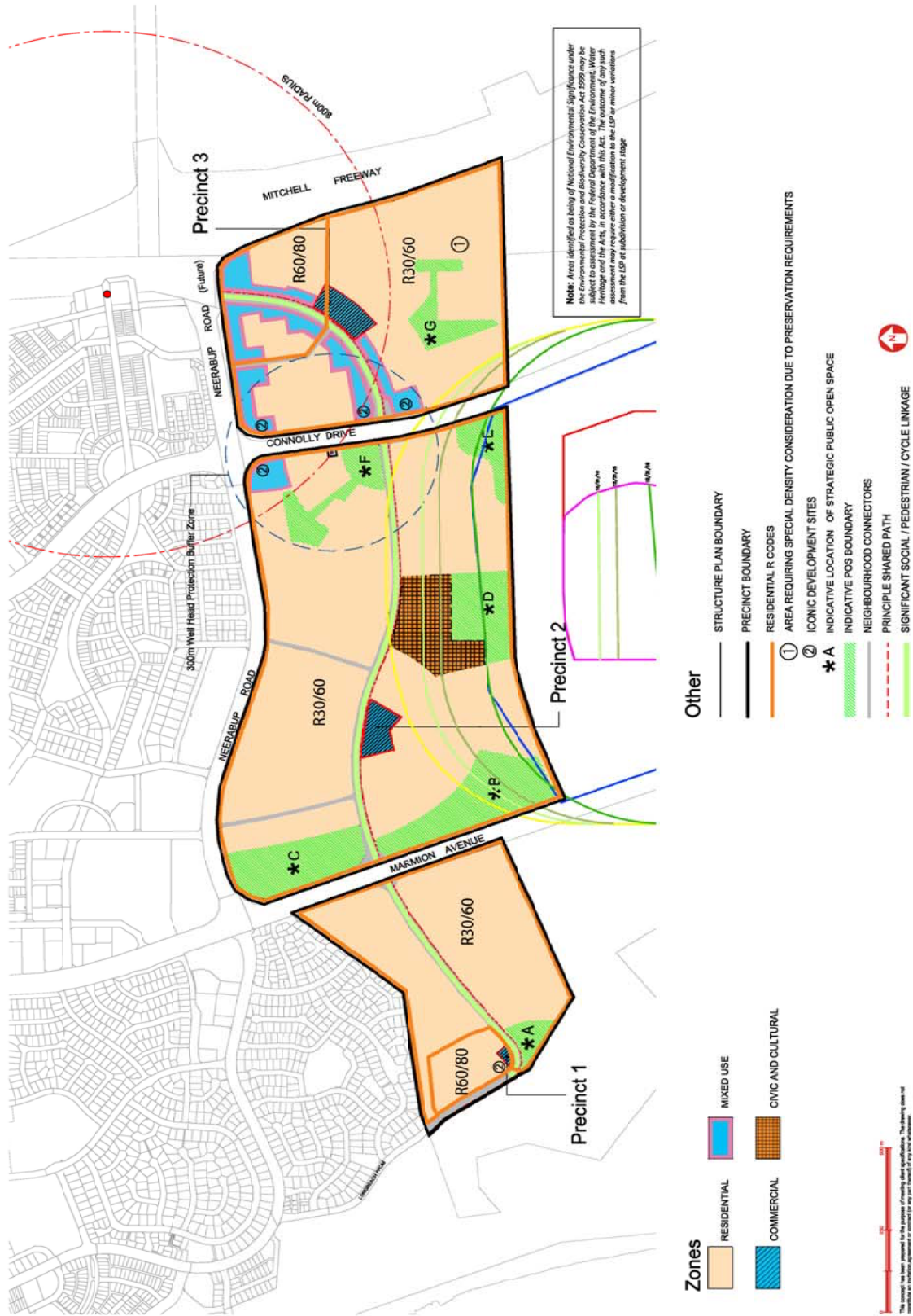
2228-31-01 (not to scale) Source: TP/G TAMALA PARK LOCAL STRUCTURE PLAN MAP Note : All boundaries indicative only and subject to survey and verification