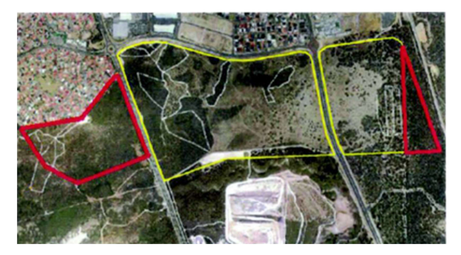
Figure 4: Attachment D - Native vegetation areas subject to condition 5 and 6 (shown in red)