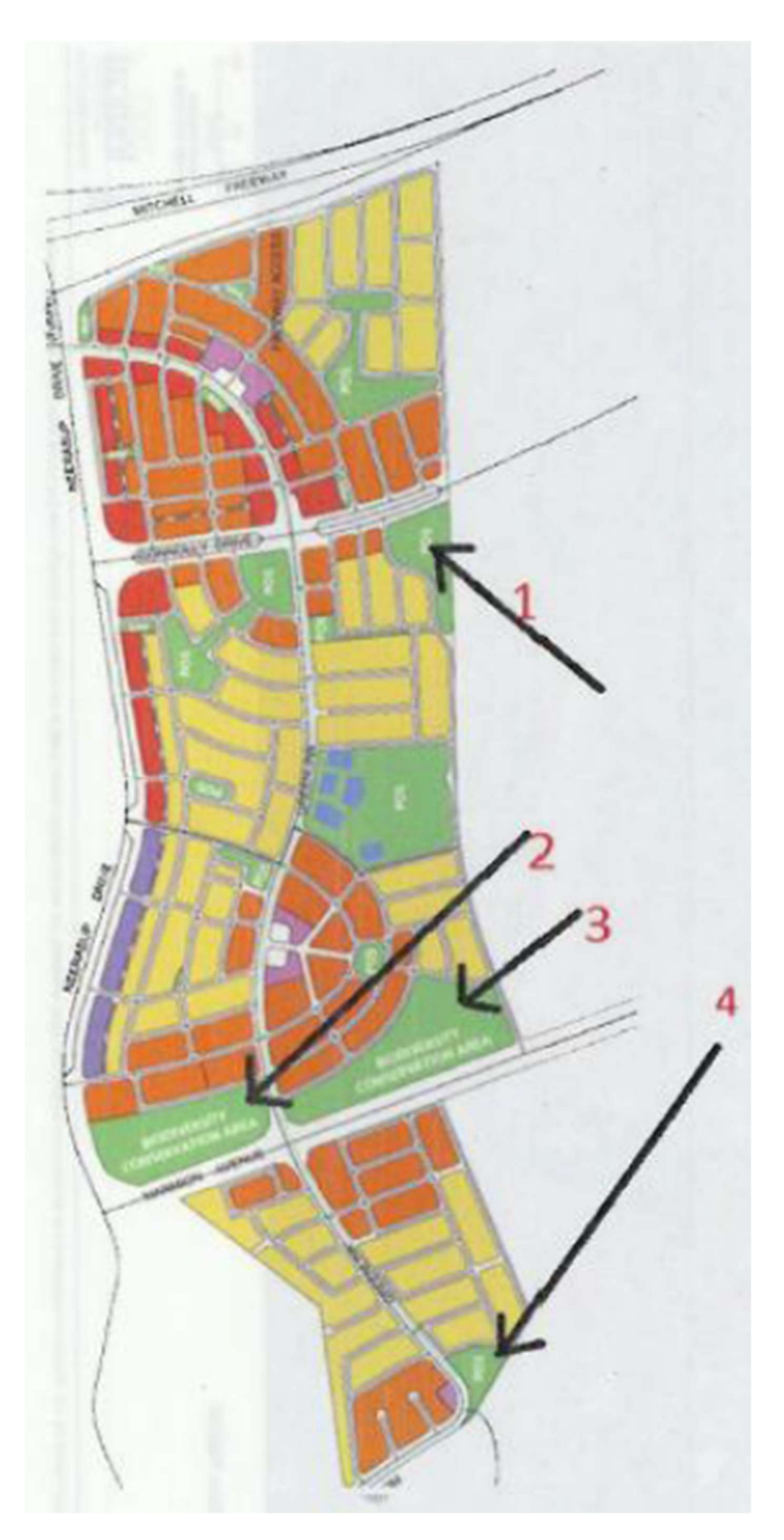
Figure 2: Attachment A - Approved variation to EPBC approval mapping.