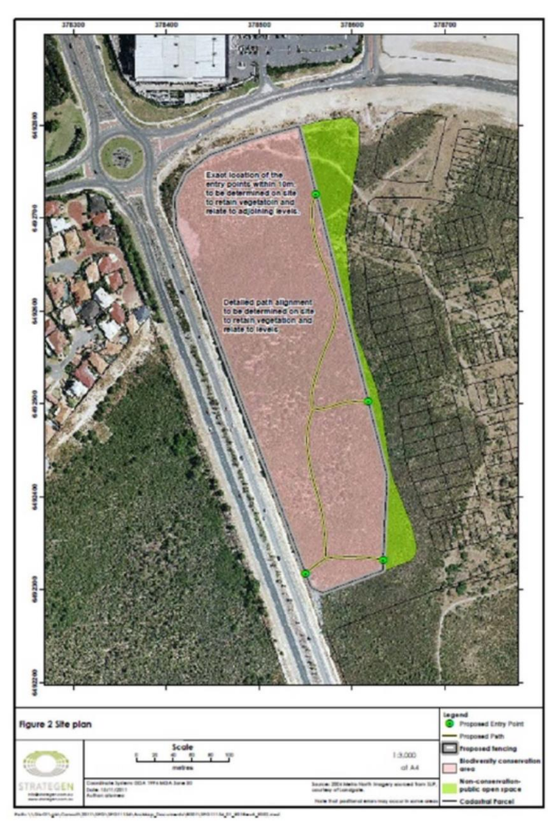
Figure 3: Catalina management tracks to be formalised as per final approved variation