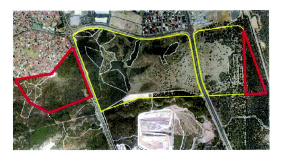
Figure 4: Attachment D; Native vegetation areas subject to conditions 5 and 6 (shown in red)