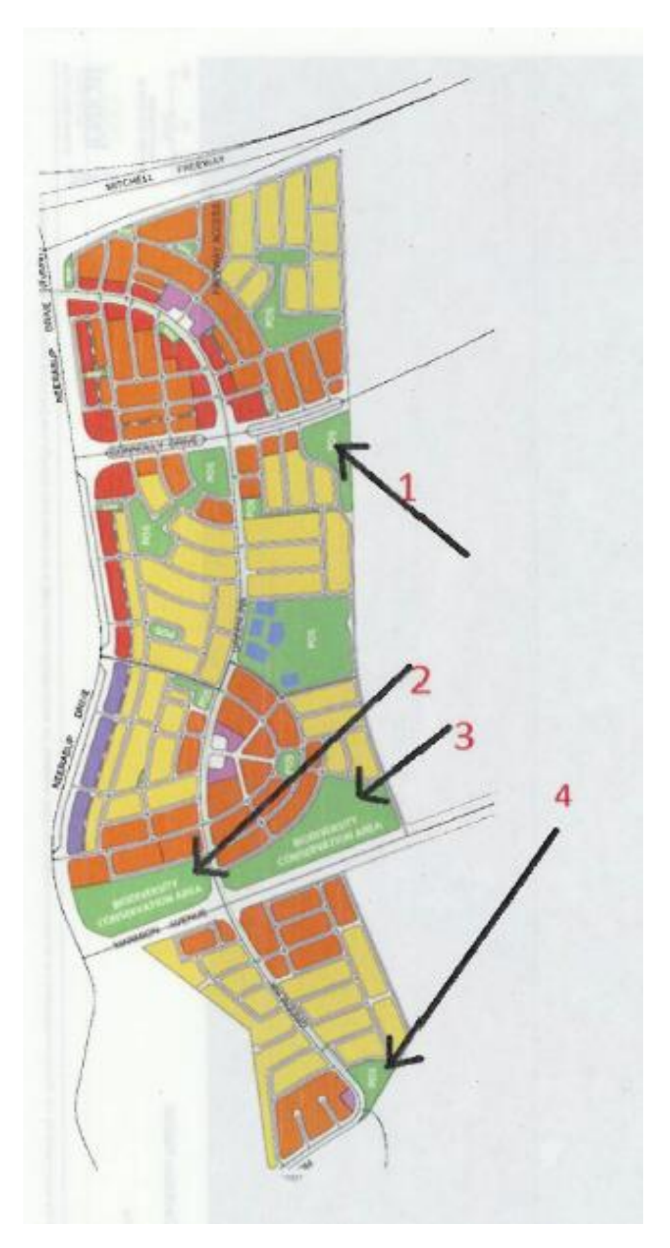
Figure 2: Attachment A; Approved variation to EPBC Approval mapping